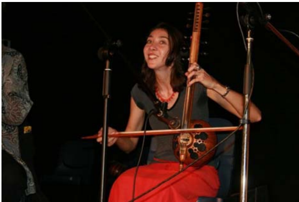
Above: Musicians used Middle Eastern instruments at the festival