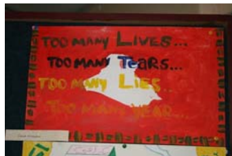
Right: Example of Iraqi children's artwork